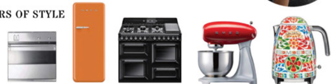
PHOTOGRAPHY (TOP LEFT) GATH MUSCAT